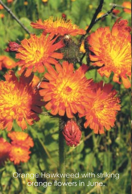
Orange Hawkweed with striking orange flowers in June.