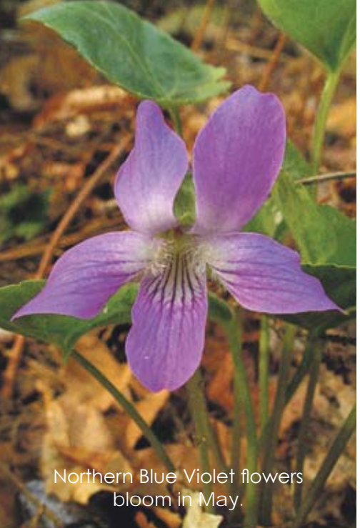
Northern Blue Violet flowers bloom in May.