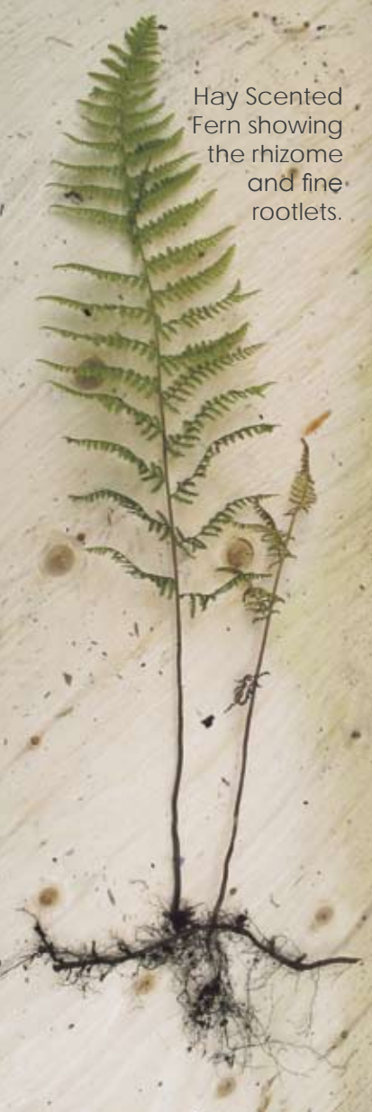
Hay Scented Fern showing the rhizome and fine rootlets.

interspersed with flowers. A nice native fern, which fills in large patches, is the Hay Scented Fern, a medium sized upland fern. It is able to withstand several hours of direct sunlight each day. The rhizome, the underground stem from which the leaves grow, is only a few inches deep, and the roots are very thin and shallow. Any of the smaller to medium sized ferns, whether native or cultivars, are very attractive among flowers. Avoid the larger ferns on top of the tile bed, and in particular avoid Bracken with its deeper wide spreading rhizome.