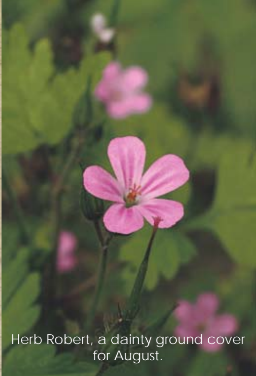
Herb Robert, a dainty ground cover for August.

And so be brave. At least get started. Do it for the environment.